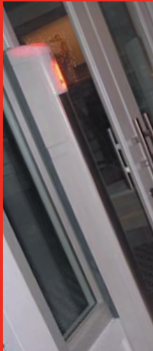
Electronic Article Surveillance

Checkpoint Systems is the leading supplier of shrink management solutions. Checkpoint's global team partners with retailers to reduce theft, increase inventory visibility and provide customers with greater merchandise availability through a combination of advanced RF technology, a broad merchandise protection program, added-value software and real-time labeling solutions.