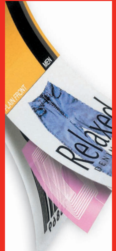
Check-Net Labeling Services