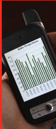
Shrink Management Software